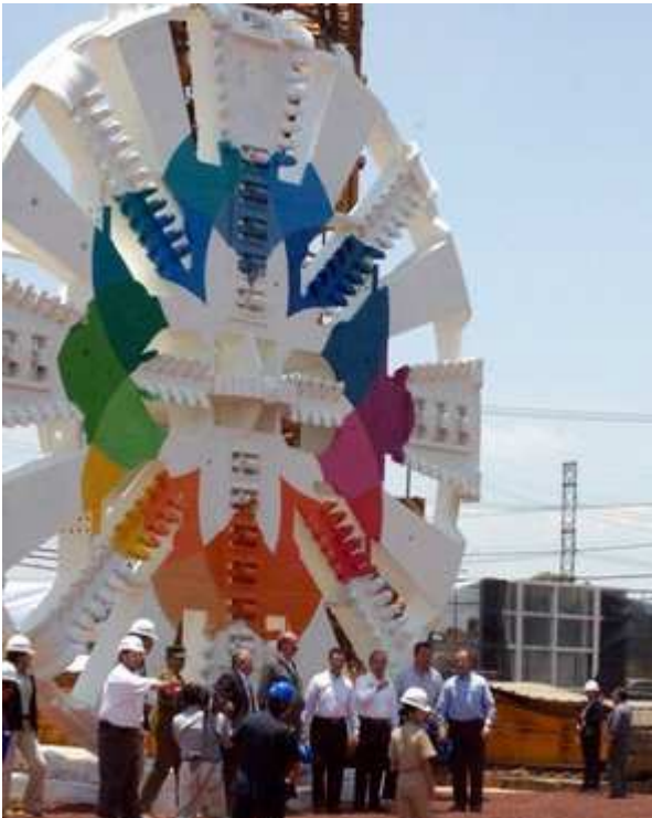
Drilling head for a new 43 km drainage tunnel. Cap: 120 m 3 /s.

A vast majority of Mexico City's close to 25 mill. inhabitants is currently living without sufficient water supply. Potential extreme flooding of vast urban areas is a serious and very possible reality caused by an obsolete storm draining system. Systems have not been modernized or amplified in capacity for 30 years ...during which the population of Mexico City has doubled!