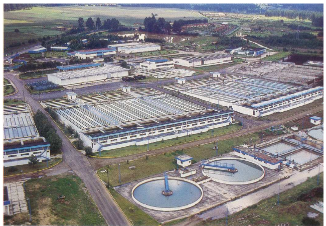
Water Purification Plant "Los Berros". Capacity: 20 m 3 /sec.

Visit to one of the worlds largest water potabilization plants, known as "Los Berros" (to be confirmed).